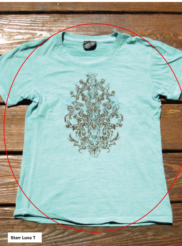
Starr Luna T